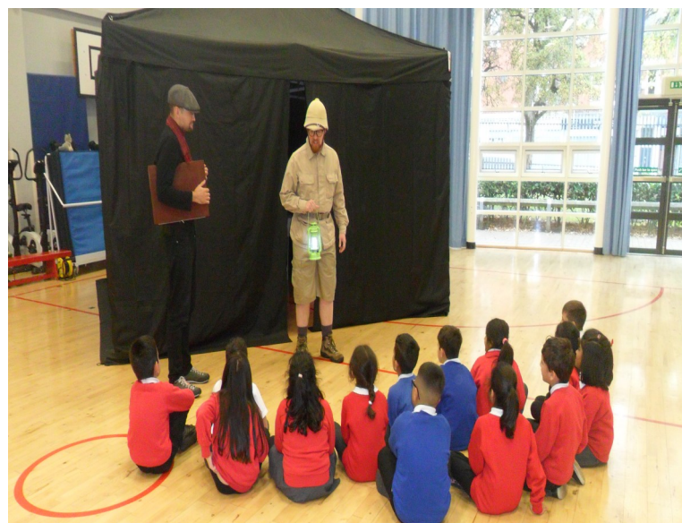
Children enjoying the 'Story Well' project now called 'Curious Beasts'. Delivered in conjunction with Well Newcastle Gateshead Arts Fund and